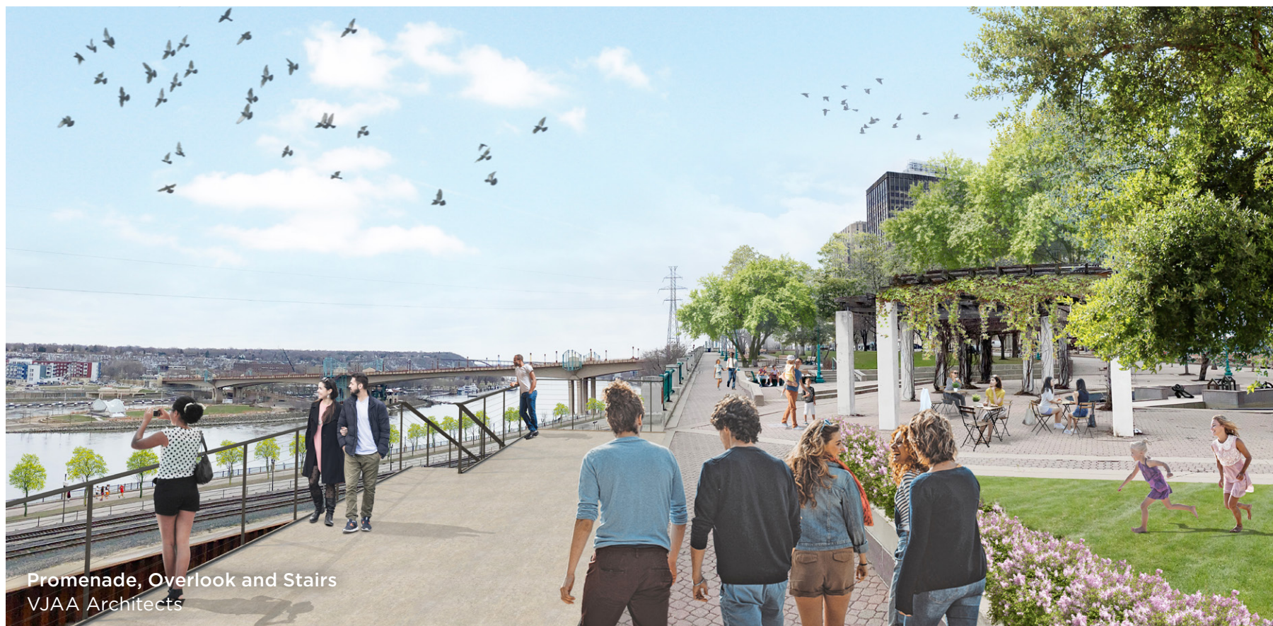
Promenade, Overlook and Stairs VJAA Architects