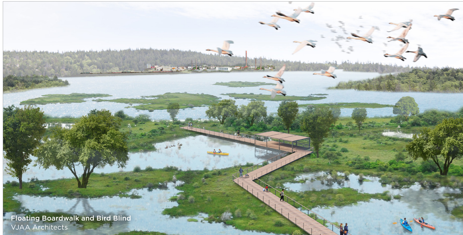
Floating Boardwalk and Bird Blind VJAA Architects