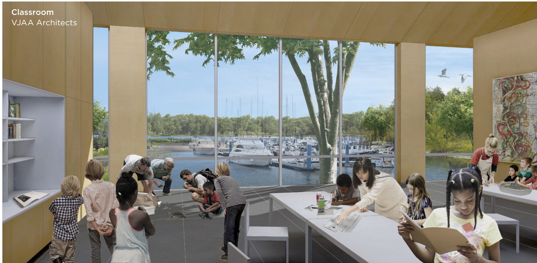
Classroom VJAA Architects